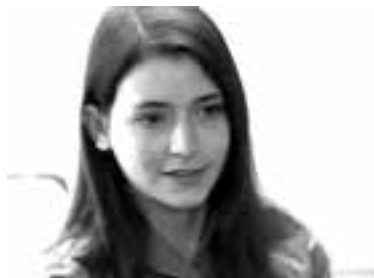
"I feel better about myself when I weigh less. I don't know, it almost makes me feel good that I am doing harm to my body. I don't really know why. It's not just about food and losing weight. There are a lot of underlying issues ... like a lot of people need the control."