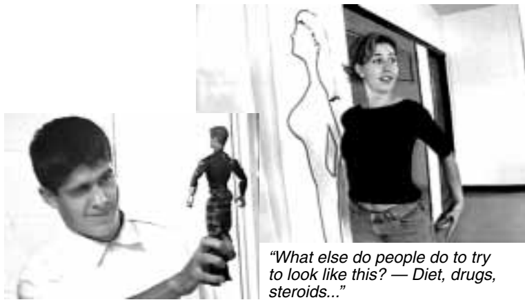
"What else do people do to try to look like this? — Diet, drugs, steroids..."