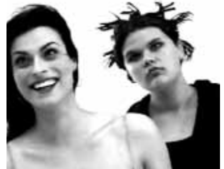
"I was bulimic for seven years... I have seven caps and 11 root canals: when you throw up, your stomach acid comes up in your mouth (and) actually eats the enamel of your teeth. My bulimia started (when) someone at school told me that I was fat... I didn't think that it would take over seven years of my life... (But now) I eat three times a day, which is a very important thing to do."

Follow eleven teens as they're forced to confront how popular ideas of "beauty" can damage young