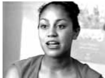
"We go into the bathroom in, like, a group and go: I'm going to throw up and then you could throw up and then she'll throw up... Appearance is so important to me. I wanted to be a model when I was little. And I was going to be in gymnastics and ice-skating. Those are all like pretty things — but for those things you gotta be small-figured."